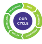
CICLE OF CONSCIENCE